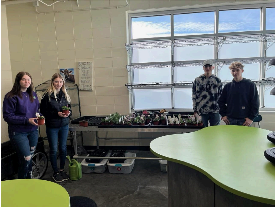
Getting some plantings ready for the Spring Sale!

Our FFA Chapter has been busy with Leadership Development Events, Career Development Event Preparations, FFA Week and Leadership Conferences.