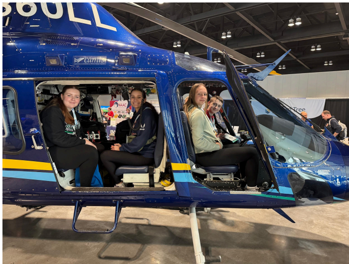
Healthcare Students at EMS Conference. (Left)

Pictured below are some student projects from our CTE department.